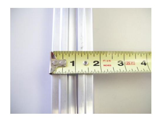
1 ¾ inch "wide" side.