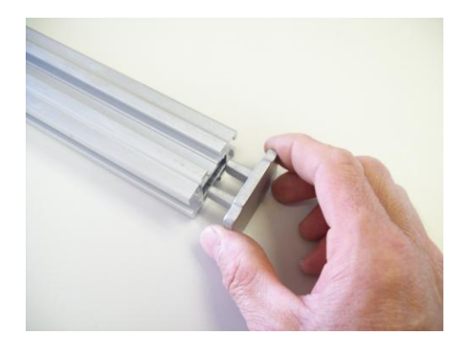
Install a vinyl cap and aluminum foot on each end.