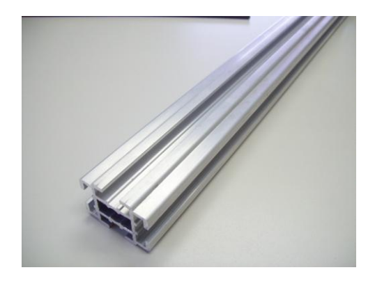
10 cross bars at 72 inches. 4 uprights at 66 inches.