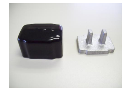
Vinyl cap and aluminum foot – 4 each.