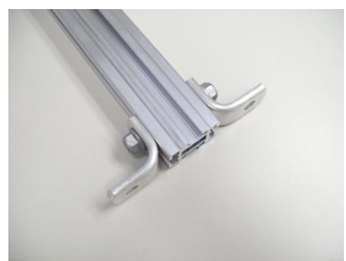
Install the shorter leg of the 3 inch angles to the ends of the 10 cross bars.