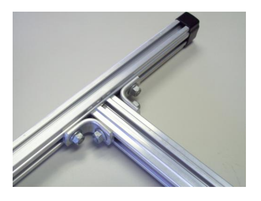
(Pencil marks.) Install 3 cross bars to the T-bolts in the wide sides of the uprights. Align the center of the cross bars with the pencil marks on the uprights.