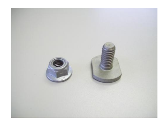
T-bolt and lock nut – 80 pieces each.