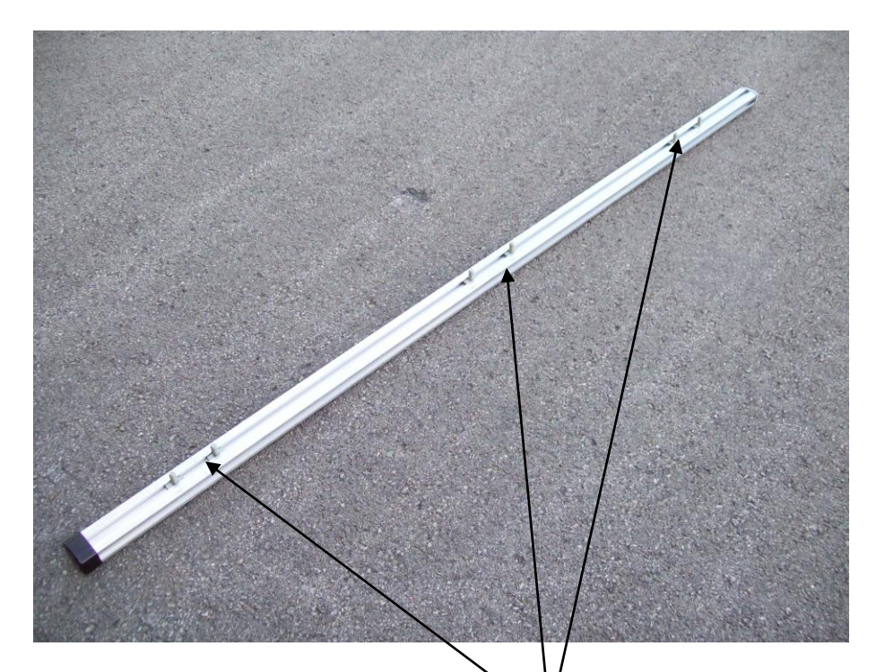
Lay out the four 66 inch uprights and install 6 T-bolts in the wide side and 4 T-bolts in the narrow side of each. (Pencil marks.)