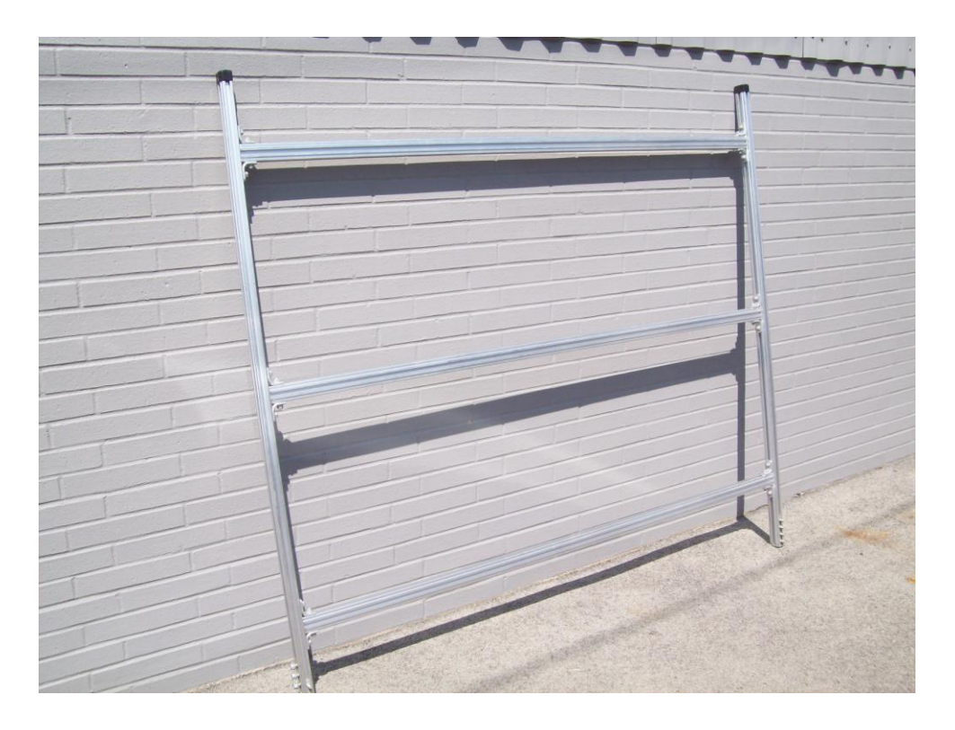
Finished rack section. Repeat for the other side.