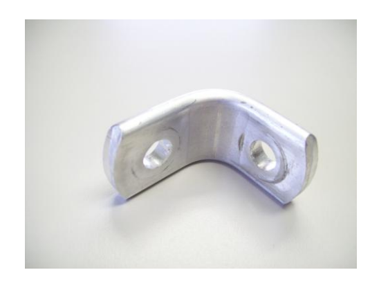
3 inch angle -40 pieces. One leg is slightly longer than the other.