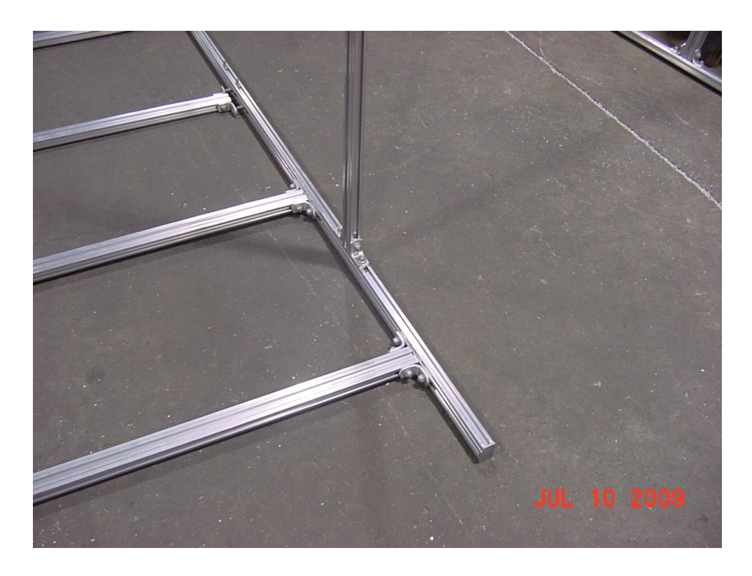
Install the 4 cross bars that hold the two rack sections together on the "narrow" side of the uprights at the pencil marks.